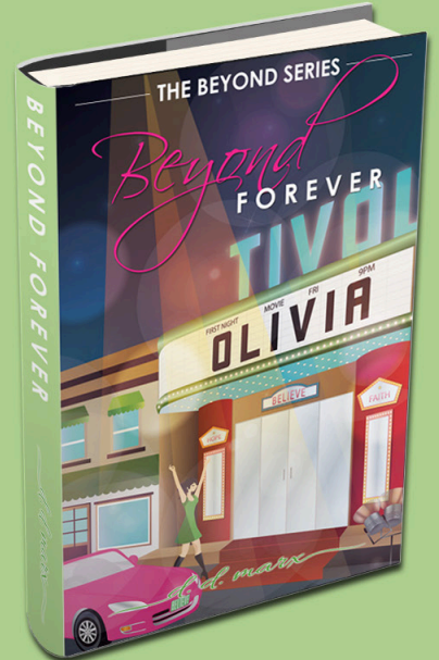
Book 3: Beyond Forever

Kick off your Book Club Group discussion of The Beyond Series with these questions: